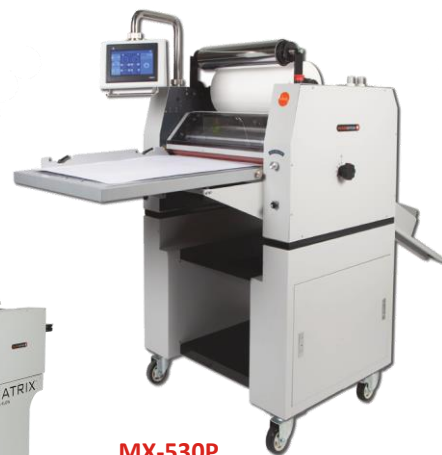
MX-530P Pneumatic Single-sided laminator