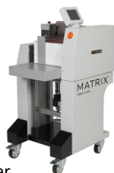
Omni-Flow Optional Deep Pile Feeder