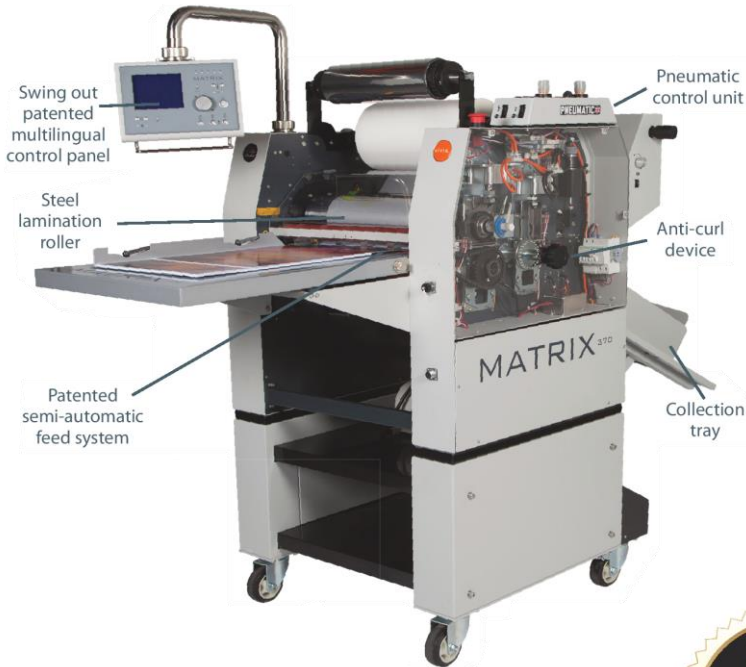
MX-370P Single Sided Laminating System