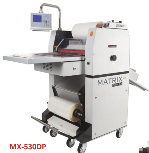
MX-530DP Pneumatic Double-sided laminator