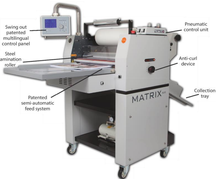
MX-530P Single Sided Laminating System