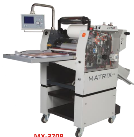
MX-370P Pneumatic Single-sided laminator